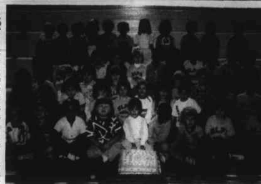
100th day The Eagle Lake Primary School kindergarten students celebrated the 100th day of school on February 2, 1990. The children began their count on August 29, 1989. To help mark the 100th day of school, the students made 100 collections consisting of miscellaneous items (cherries, pennies, cookies, candy, etc.). The students also performed 100 exercises on that day. At the end of the day, the classes shared a 100 day cake. ELPS Photo